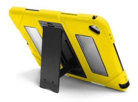
Rugged Protection Case

iPad Models: Air 2, 5<sup>th</sup> Generation, & 6<sup>th</sup> Generation