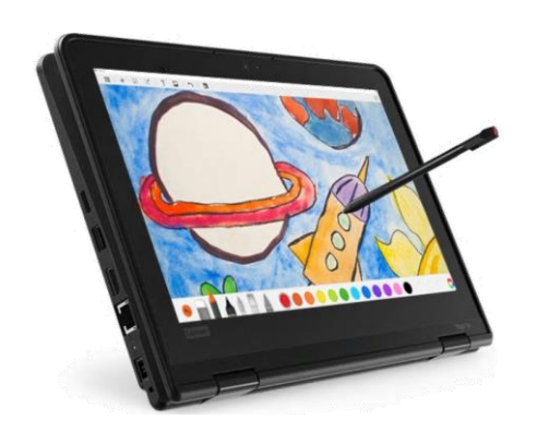
Lenovo Yoga 11e